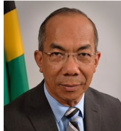
The Honourable Dr. Horace Chang Minister of National Security

The Ministry of National Security and all its departments and agencies are committed to maintaining the environments that allow Jamaica's celebrated values and truths to remain our identifying factor as a country.