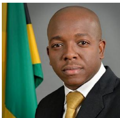
Senator Parnel Charles Jr. Minister of State, Ministry of Foreign Affairs and Foreign Trade

It is my distinct pleasure to welcome you home on behalf of the Government of Jamaica.